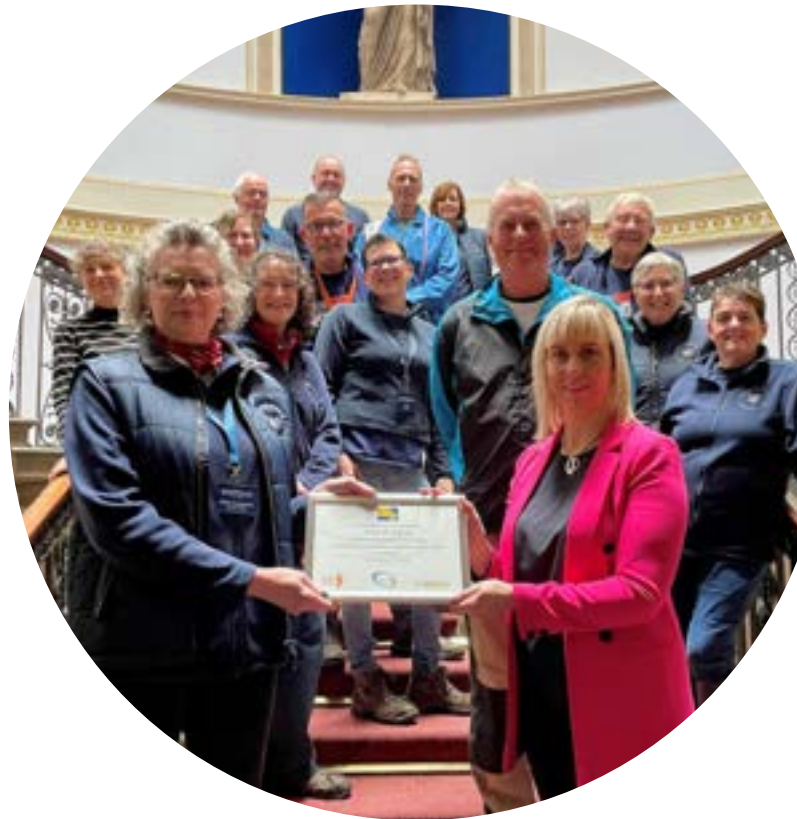
Wentworth Woodhouse receive the Kitemark Plus award

The Kitemark is a quality mark that we developed with Rotherham Together Partnership, to evidence good practice amongst local volunteer involving organisations. It recognises excellence in managing volunteers and we currently have two levels organisations can apply for – Kitemark Standard and Kitemark Plus. During the year, even with the disruption caused by the pandemic, we received a selection of kitemark plus submissions and presented Wentworth Woodhouse with their kitemark plus certificate at the end of April 2021, which was a real highlight of the year.